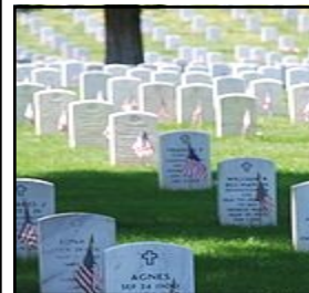
from Wikipedia, the free encyclopedia

By 1870, the remains of nearly 300,000 Union dead had been buried in 73 national cemeteries, located mostly in the South, near the battlefields. The most famous are Gettysburg National Cemetery in Pennsylvania and Arlington National Cemetery , near Washington.