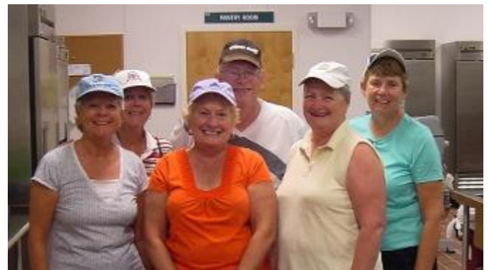
When you see these folks in the halls, and around FUMCH campus, say "Hi", and add a "Thank You."

I'm honored to be among those attending the Academy and very excited about what I am learning and will be bringing back to share with all of you. Sharing the Academy teachings will enhance our yearning to grow as Disciples of Jesus Christ and encourage our quest for a more passionate spirituality.