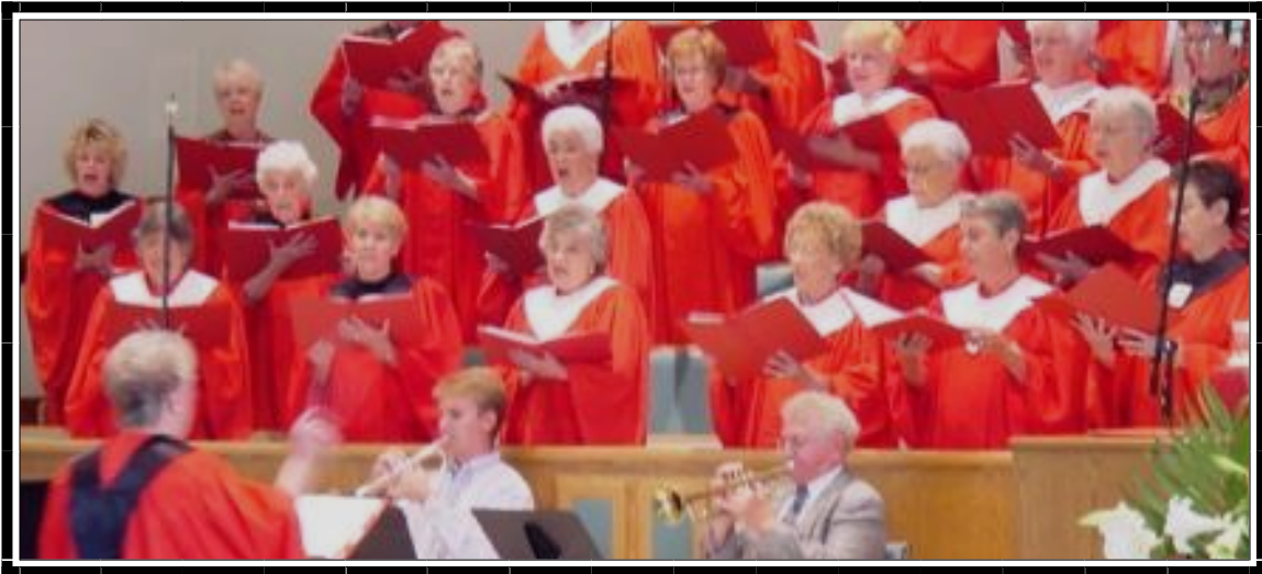
PRAISE SONG ~ "Jesus Is Alive"