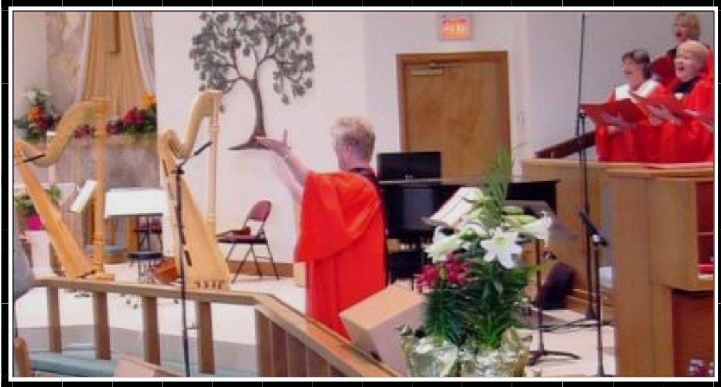
THE HYMN OF PRAISE ~ "Hallelujah Chorus"